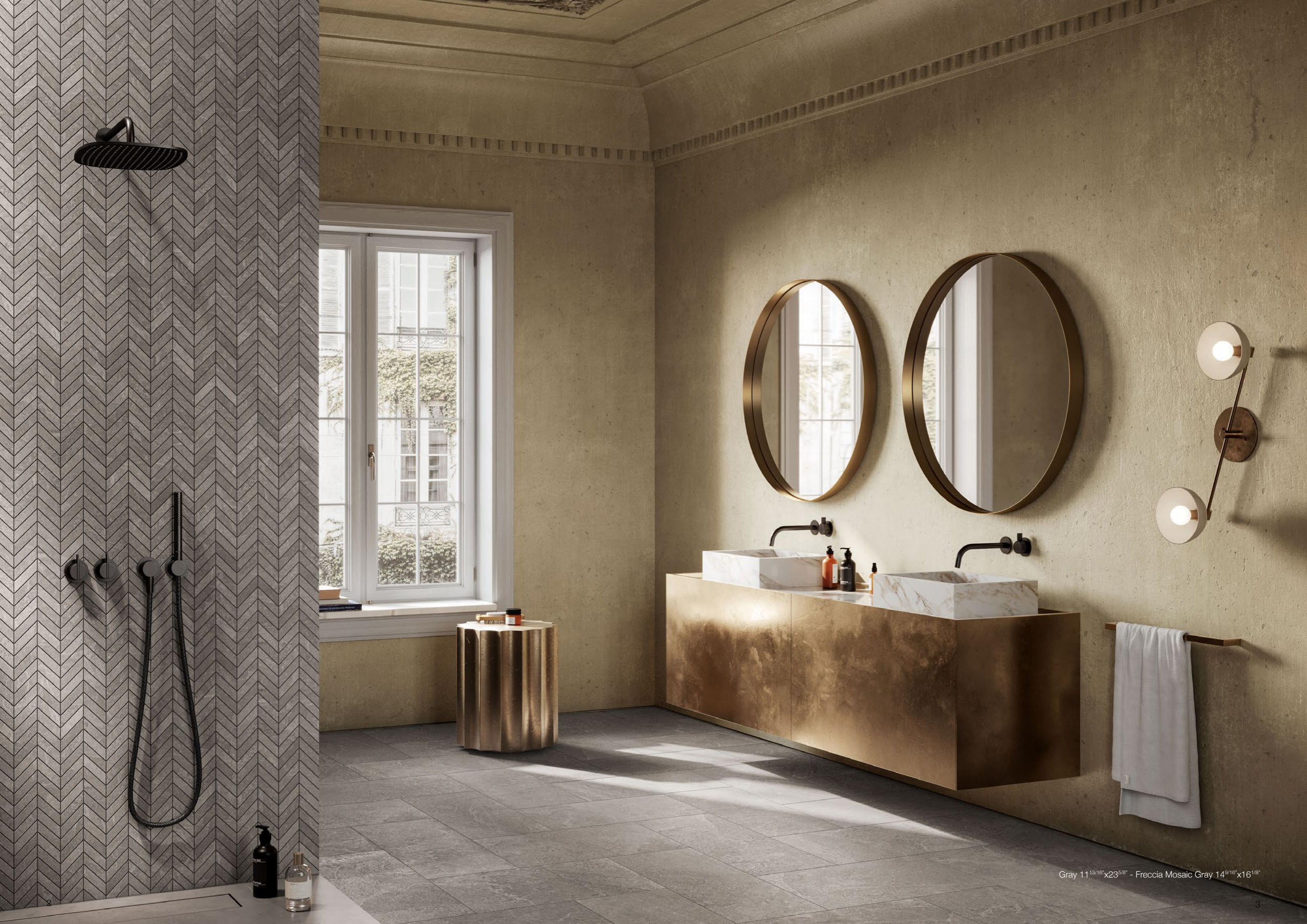
Gray 11 13/16" x23 5/8" - Freccia Mosaic Gray 14 9/16" x16 1/8"